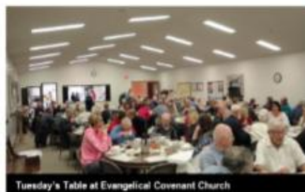
Tuesday's Table at Evangelical Covenant Church

206 Main St. N PO Box 823 New London, MN 56273