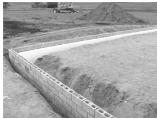
The foundation is laid...