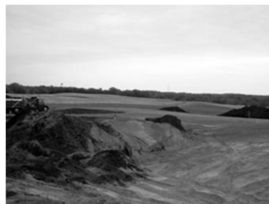
Leveling the land...

More photos and updates at www.livingwordlutheran.net