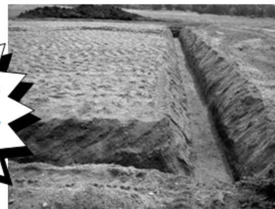
Trenches for foundation are dug...

More photos and updates at www.livingwordlutheran.net